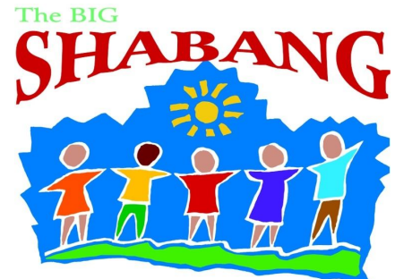
Sponsored by NMC, NCSS, YOGI & GICCT