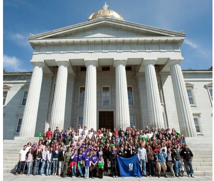
Because We Care group photo

The efforts of Vermont's community prevention coalitions were recognized in the House Chamber.