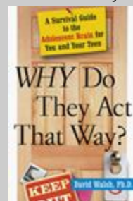
Why Do They Act That Way? A Survival Guide to the Adolescent Brain for You and Your Teen